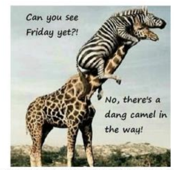
Thanks to Shellie Schexneider for submitting this cartoon!

Bay Area Turning Point is SEEKING VOLUNTEERS for Tuesday, March 31st at the South Shore Harbor Resort Crystal Ballroom from 5:30-8:00pm to help set up for their Dogs and Divas Fashion Show. Please see attached for more information.