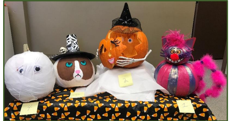
3 rd Place = Sherita Stephens (Pumpkin #1)