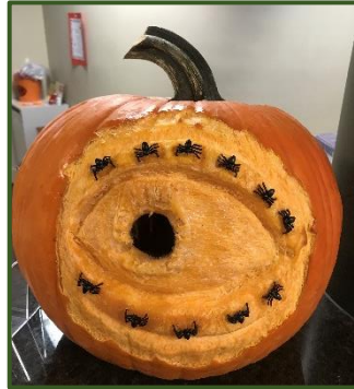
2 nd Place = Consuela Contreras