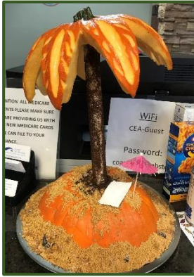
1 st Place = Kari Messer