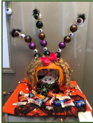
1 st Place = Amanda Knight